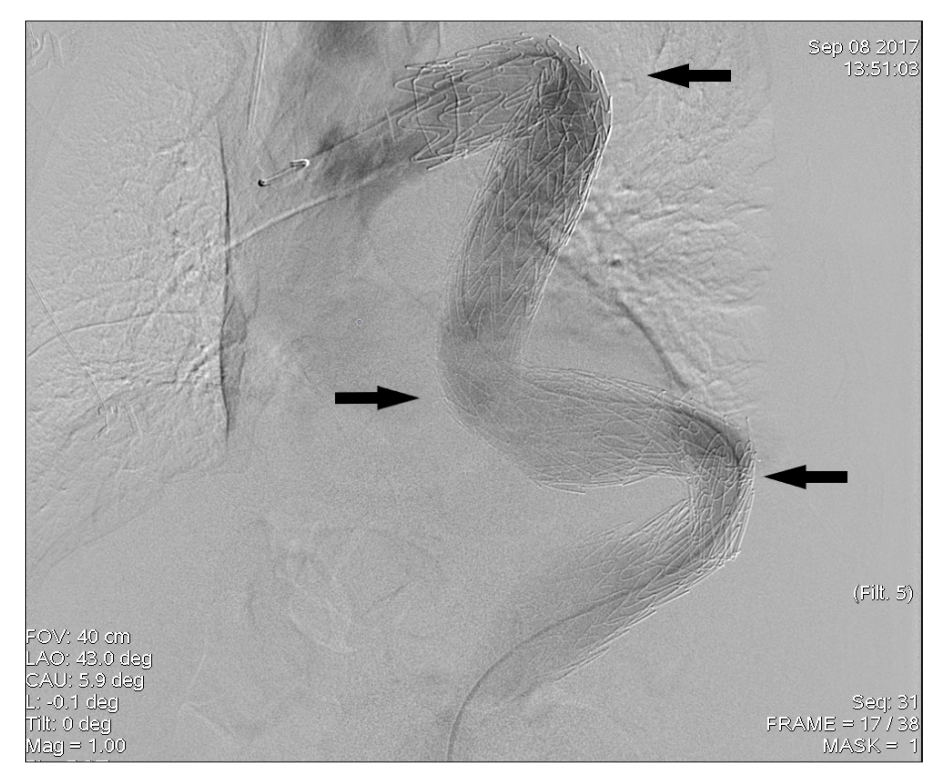
Figure 3. Intraoperative fluoroscopic image shows the appropriate opening of the stent-grafts and excessive tortuosity (arrows).

12 hours. Postoperative fourth day CT angiography showed totally thrombosed false lumen of thoracic aorta, stable left pleural effusion as well as left lower lung atelectasis. Acetylsalicylic acid 100 mg (once a day for life) and clopidogrel 75 mg ( 4\times 75 mg loading dose first day, followed by once a day for 6 months) were prescribed. Patient was discharged within the same day without any other postoperative adverse event. At 9 months after the procedure, the patient is being followed up uneventfully.